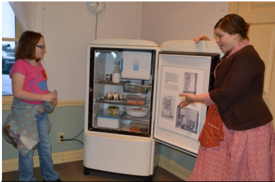
A costumed interpreter shows off her electric refrigerator- an actual appliance from the 1930's filled with replica food and an interpretive label.

You may find that static labels and objects in cases have a hard time competing with hands-on activities in the same space. In our initial evaluation of the Create.Connect prototype, we found that far fewer visitors stopped at historical objects and labels than at the STEM activities. This was an ongoing concern in creating an interdisciplinary experience. We felt that by making the historical elements of the